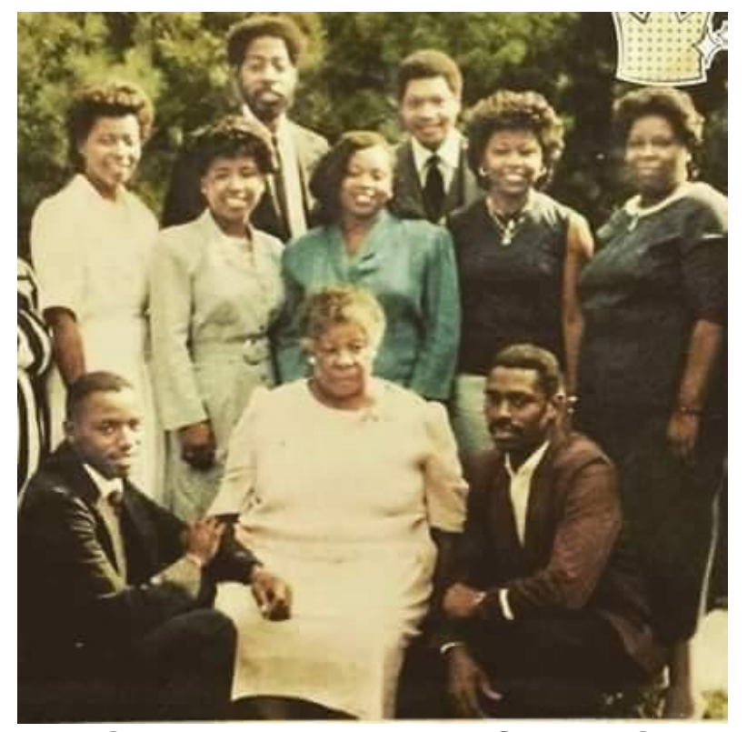
Casket Bearers Relatives and Friends