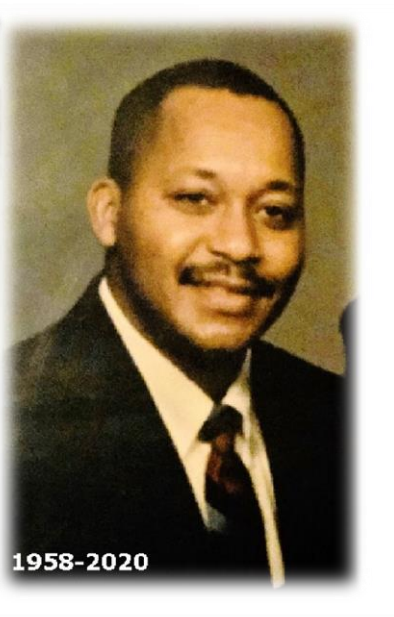
If tears could build a stairway, AND MEMORIES A LANE, I'd walk right up to heaven, AND BRING YOU HOME AGAIN