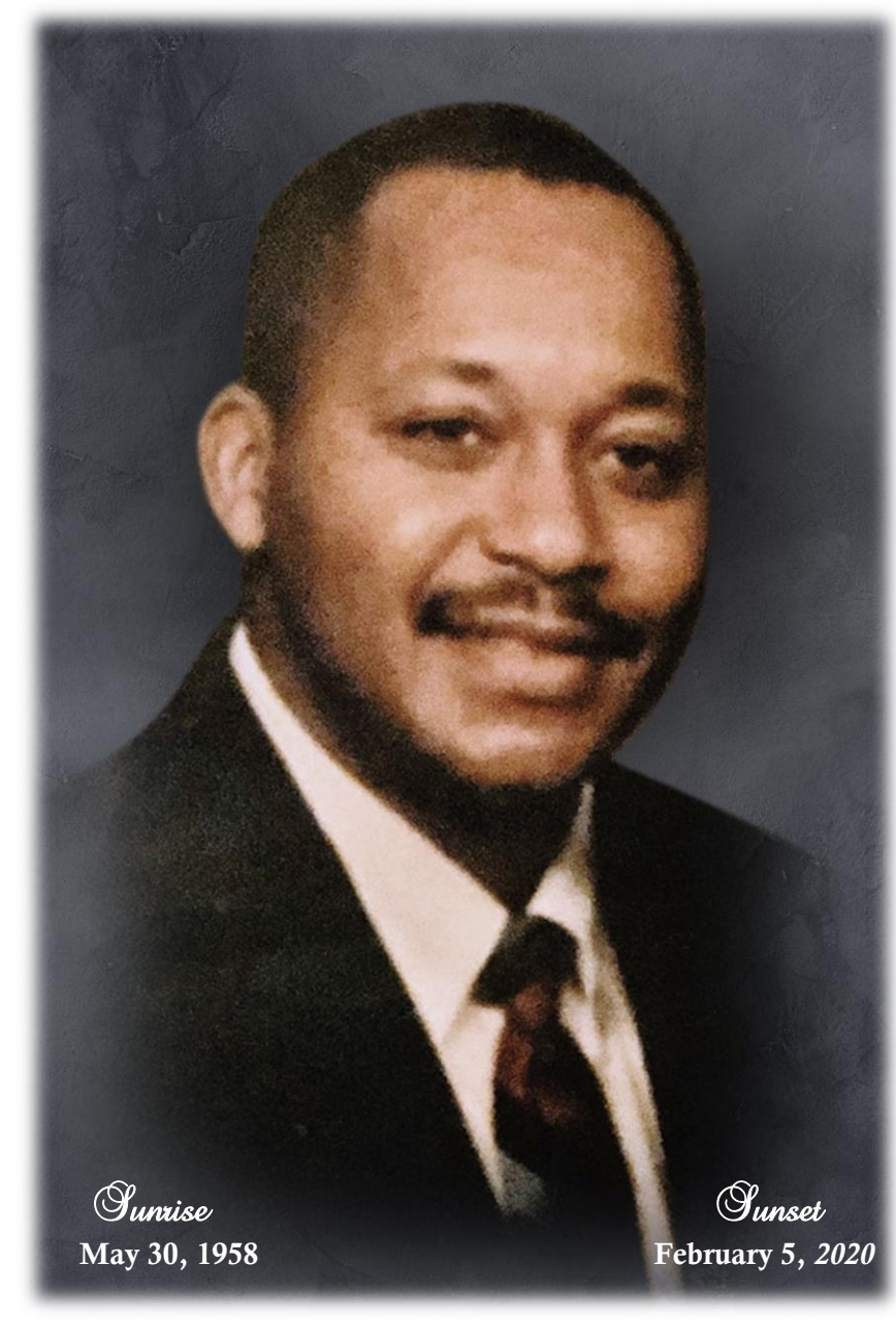
"I have fought the fight, I have finished my course, I have kept the faith." 2 Timothy 4:7