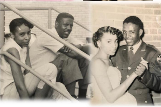
Love Is What We Will Remember The Most!