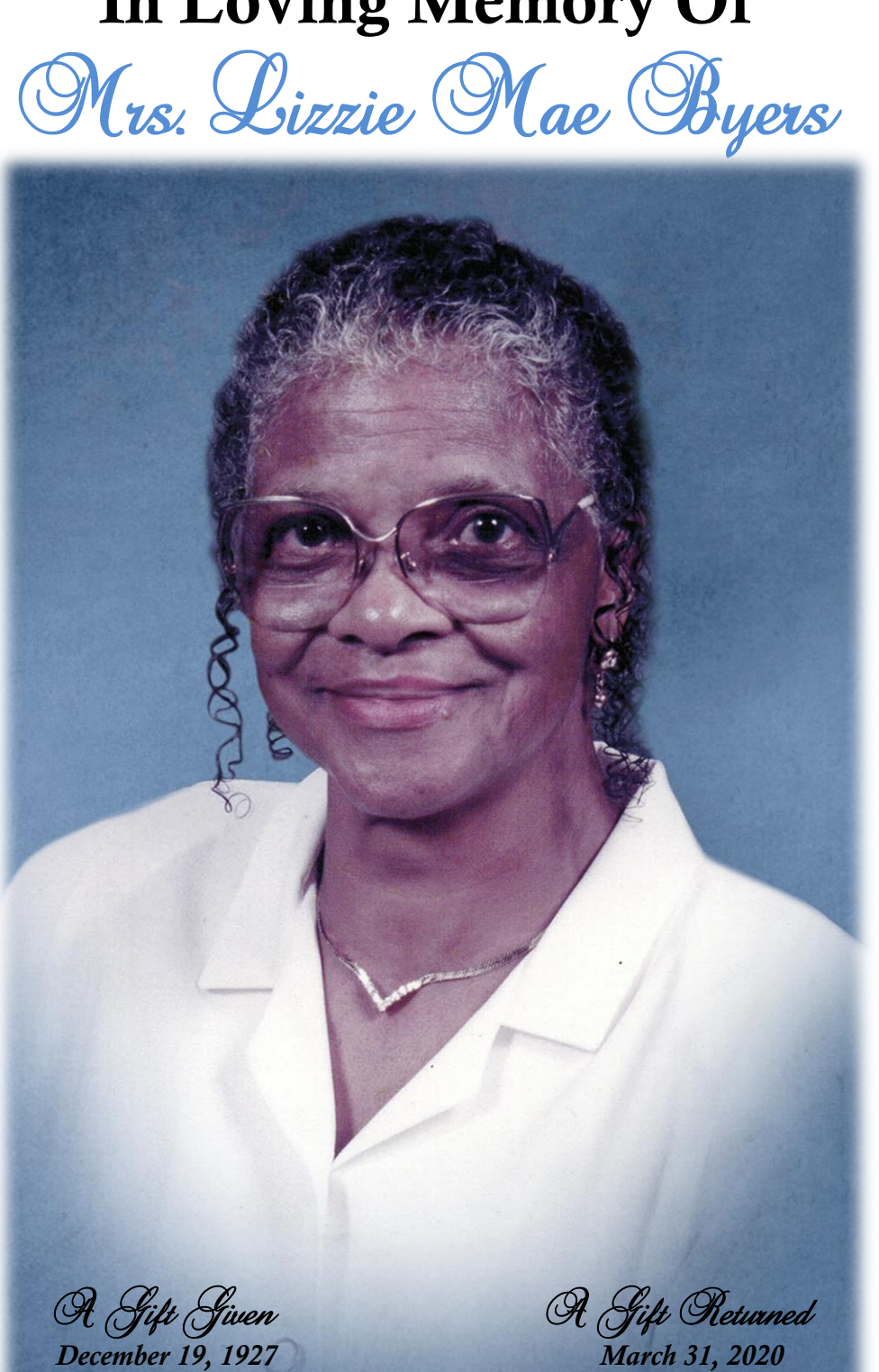
I fought a good fight, I kept the faith... I finished my course