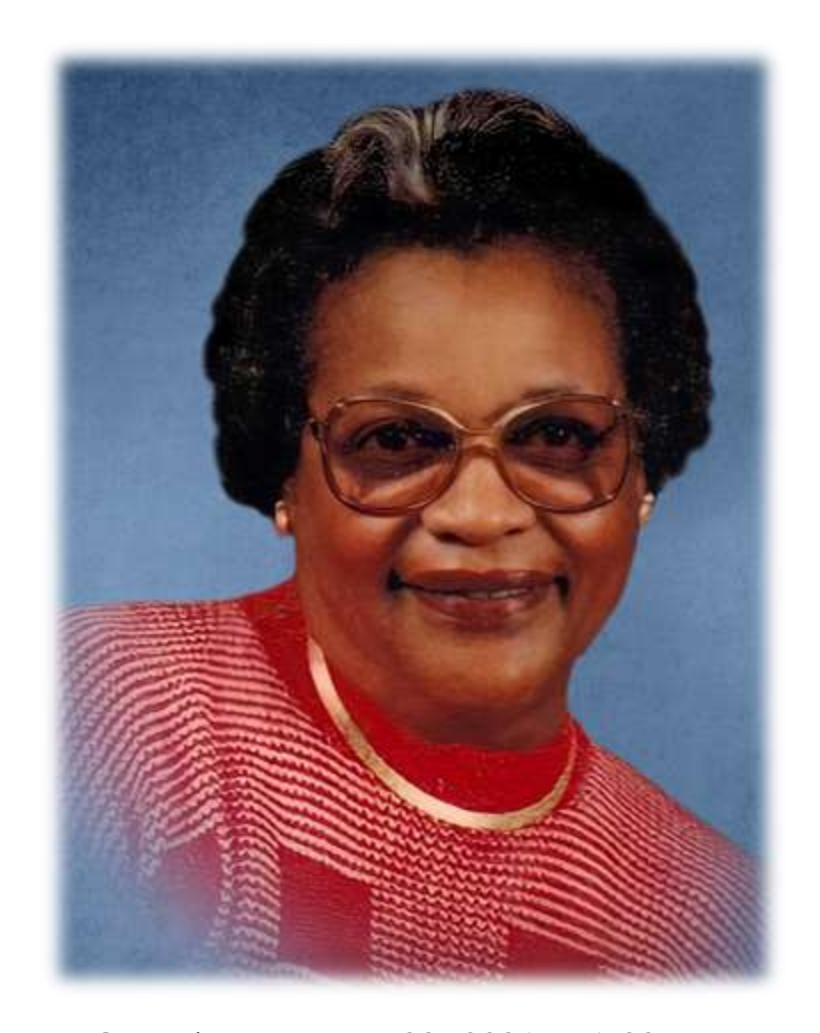
Saturday, January 23, 2021 at 1:00 p.m. Living Water Ministry Troutman, North Carolina