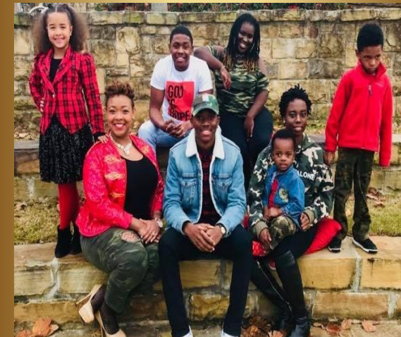
GRANDAD / POPS