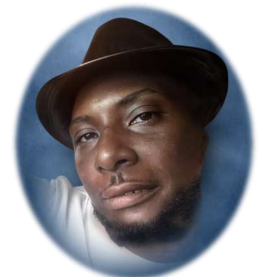
Rutledge and Bigham Funeral Home Statesville, North Carolina Tuesday, April 13, 2021 2:00 p.m.