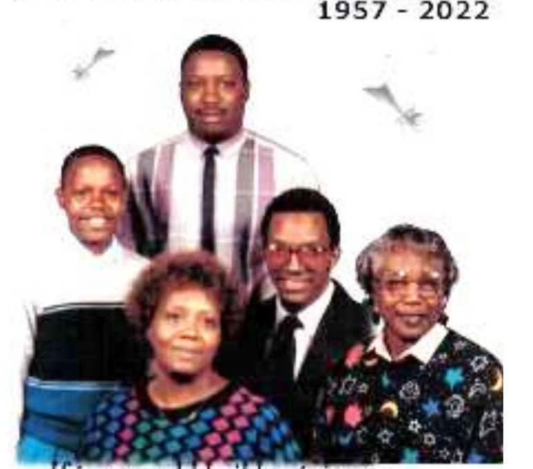
flears could build a stairway, AND MEMORIES A LANE. I'd walk right up to heaven, AND BRING YOU HOME AGAIN