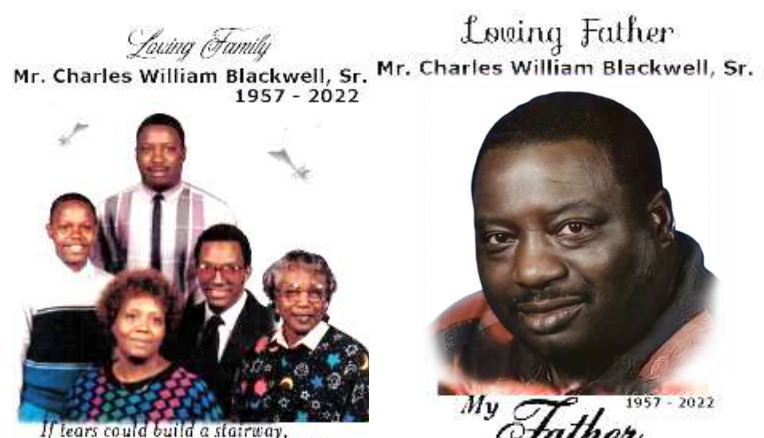
taught me everything I know except how to live without him