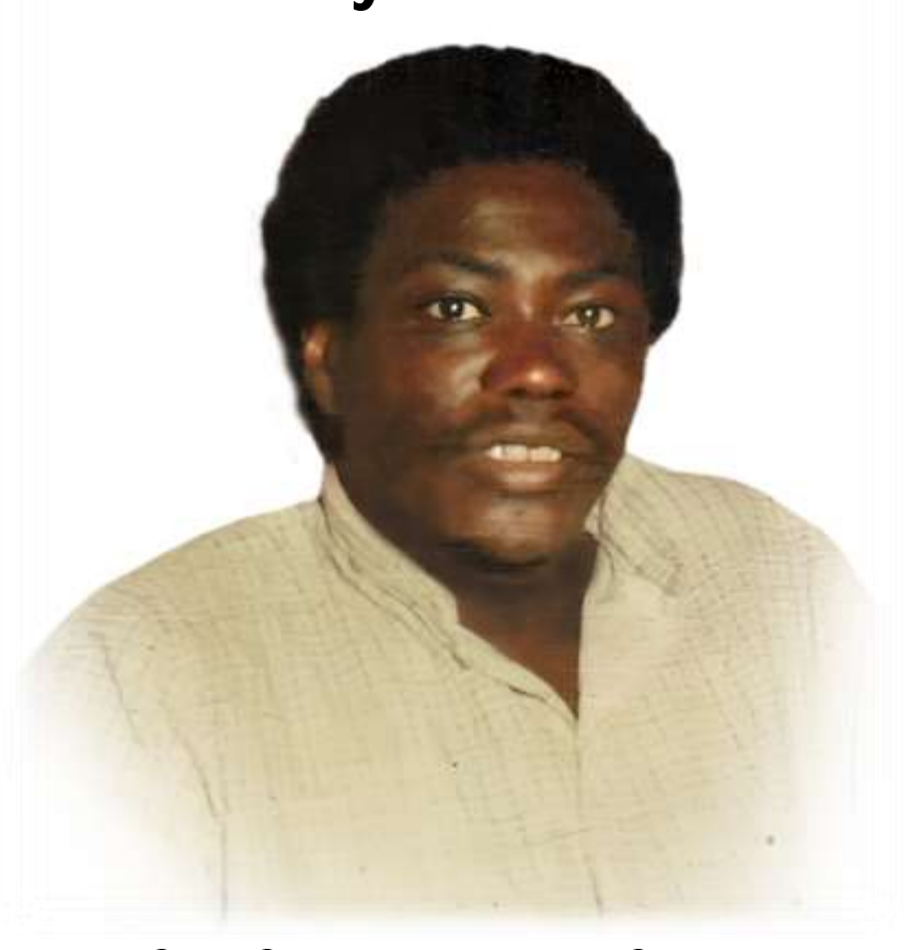
A Gift Given April 26, 1952