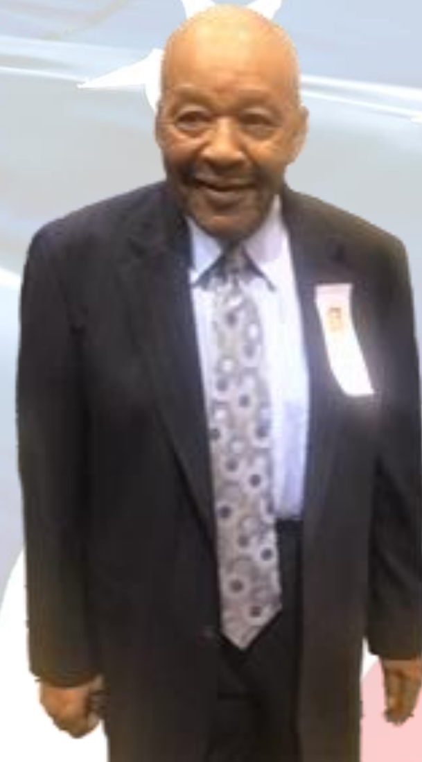
A Gift Given February 25, 1927