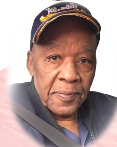
A Gift Returned February 24, 2022