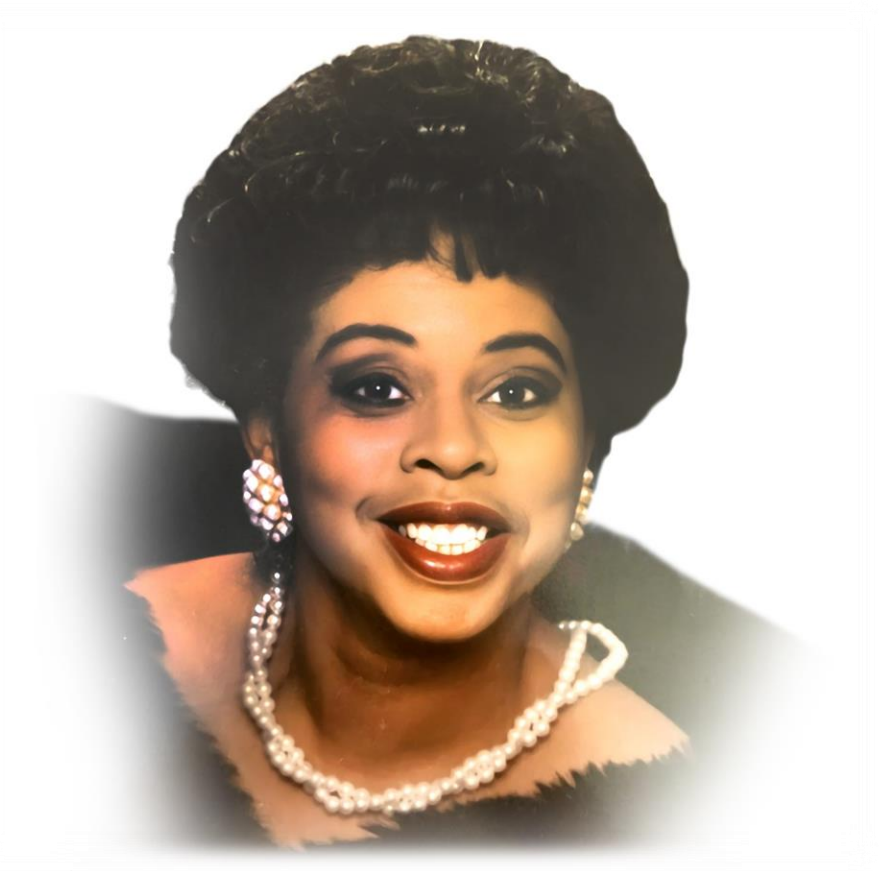
Given In Love April 4, 1962