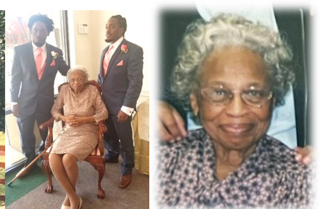
Eckles Five Generation