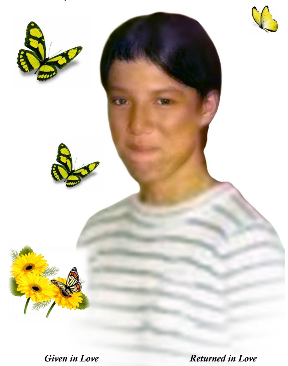
October 31, 1953